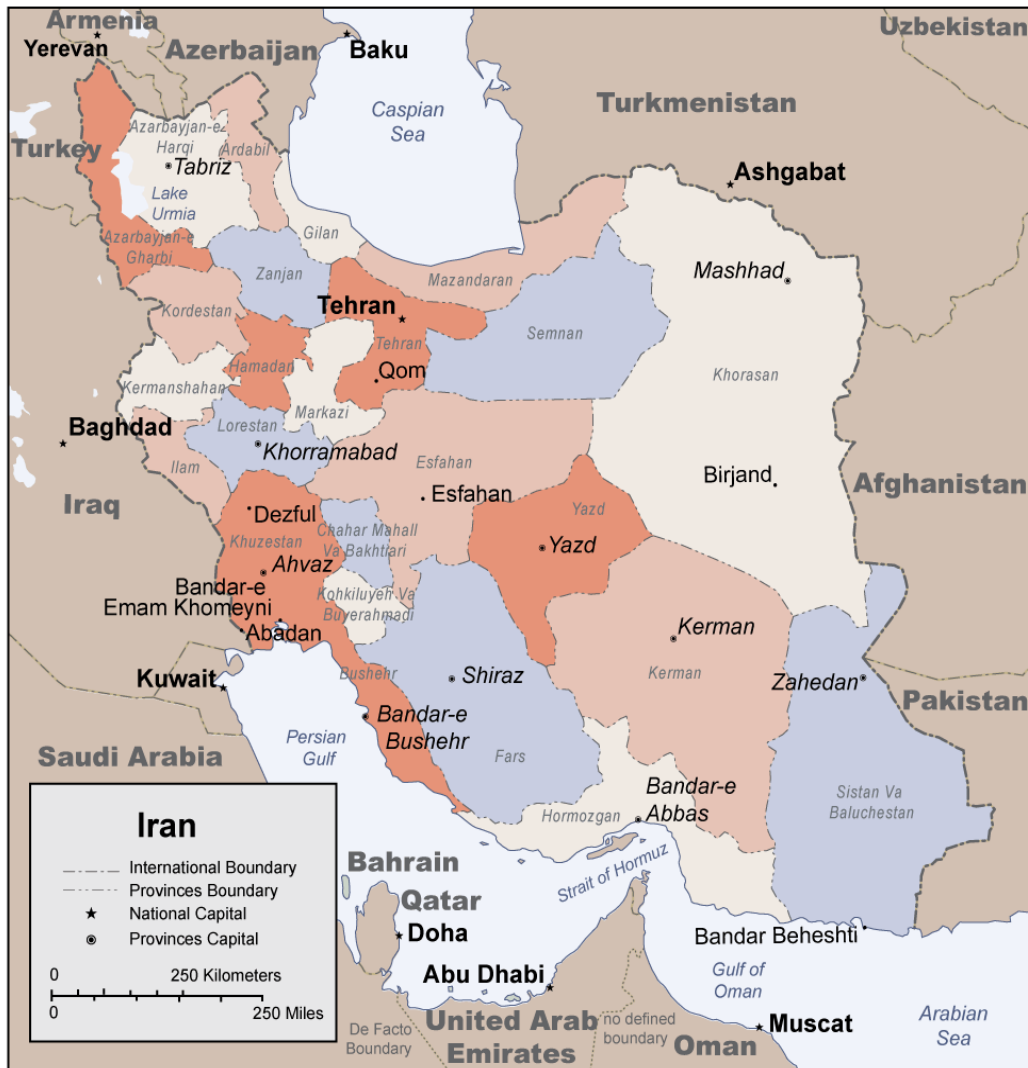
Figure 2. Map of Iran